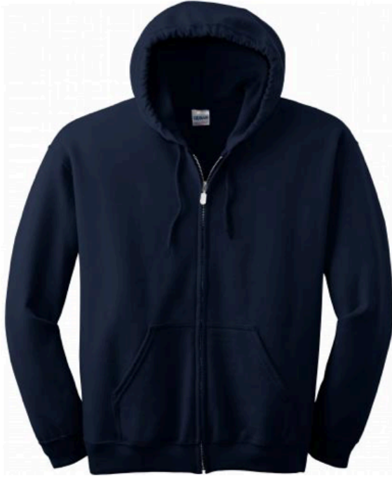
ZIPPER HOODIE G186 NAVY